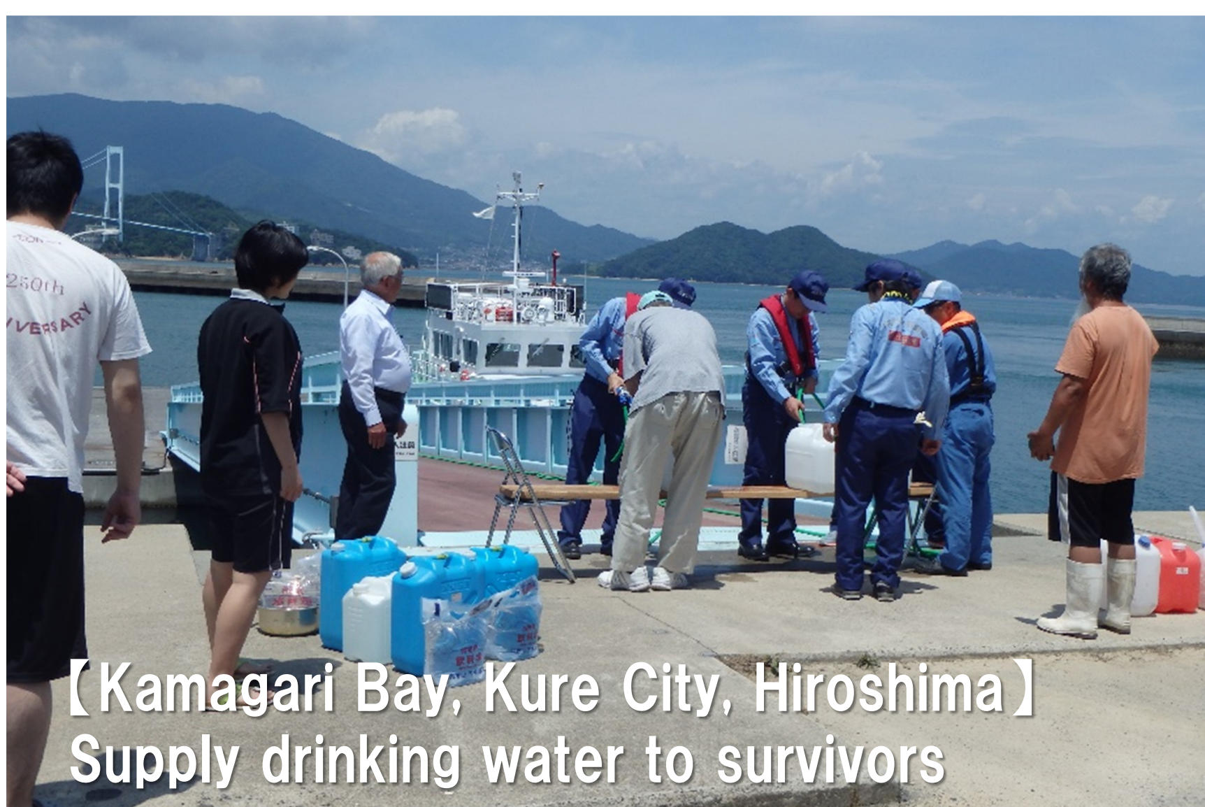
【Kamagari Bay, Kure City, Hiroshima】 Supply drinking water to survivors