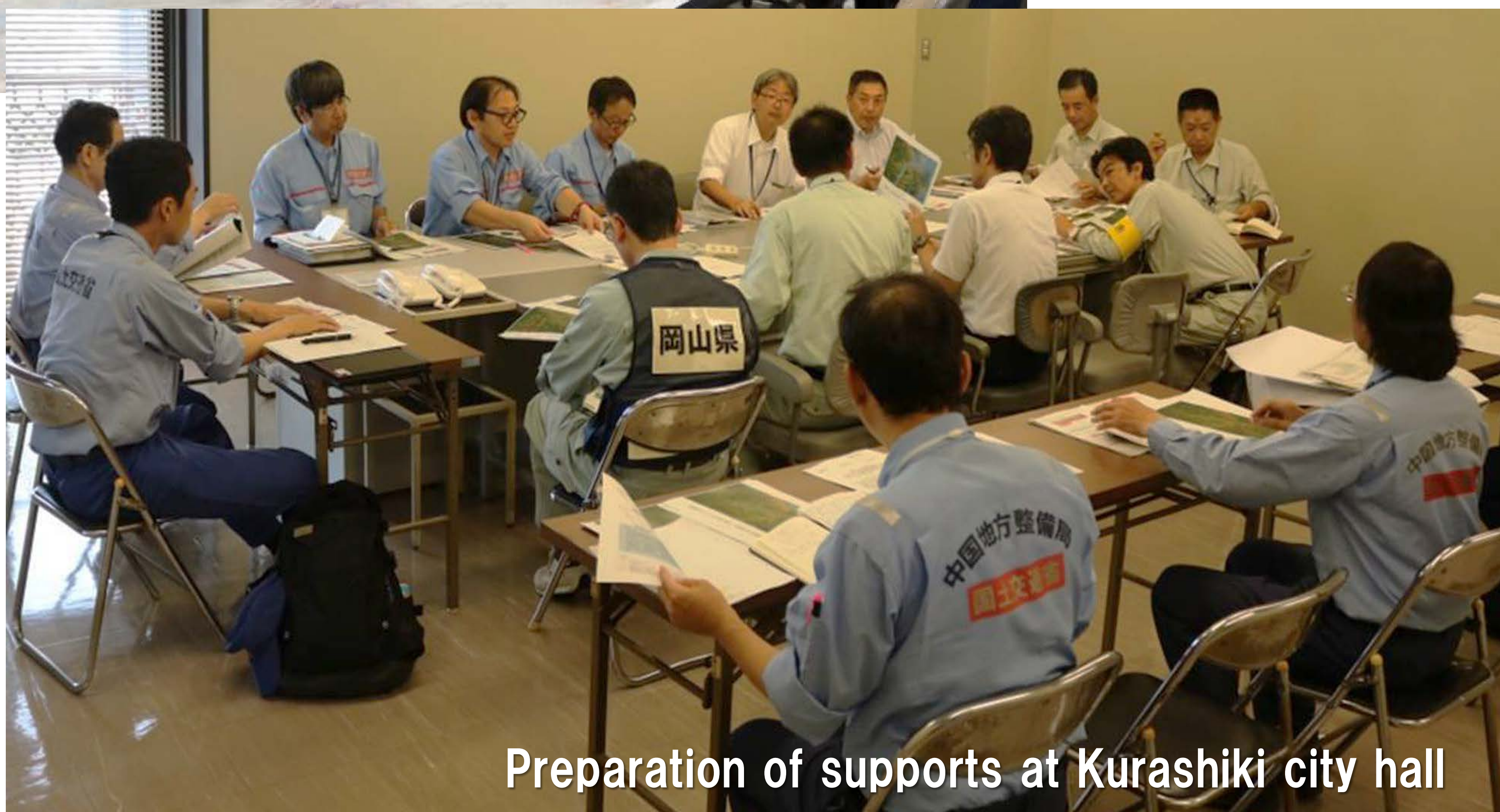
Preparation of supports at Kurashiki city hall